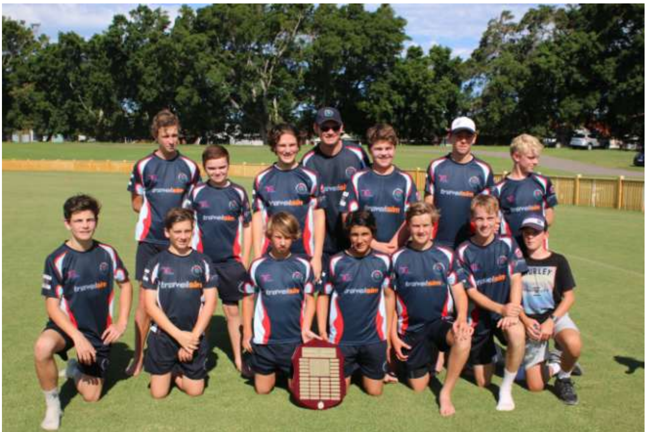
The U14 Graeme Malcolm Shield Undefeated Champions (Newcastle Country Carnival)