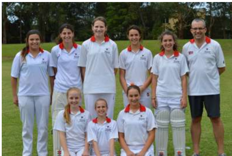
Wakehurst girls - Under 17 SGCL Premiers

The Wakehurst Redbacks club fielded an under 17 girl's team. The average age of the team was only 13, so it was a big ask to play in the under 17 competition. However, the team did exceptionally well finishing equal first in spring competition and 4 th in the summer competition.