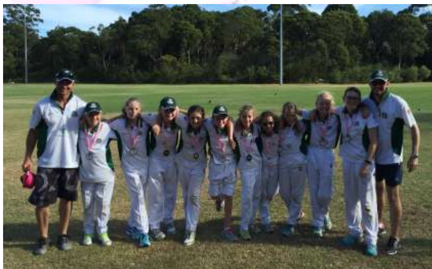
Forest girls - Under 13 SGCL Premiers

Two teams from Manly Warringah competed in this age group: Forest District and a combined Beacon Hill/Wakehurst team. Both teams had a wonderful season, the girls thoroughly enjoying their first experience of hard ball cricket.