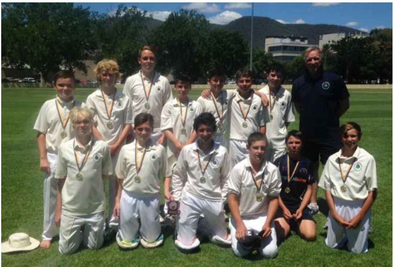
The Under 14 Tamworth Country Carnival Champions