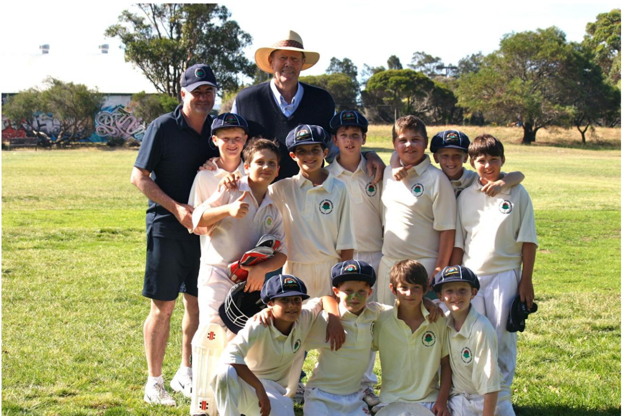
A special highlight for the boys was the opportunity to meet cricketing legend Tony Greig in Round 4 who had a son playing for South Eastern. Tony went out of his way to meet the boys and was a true gentleman of the sport