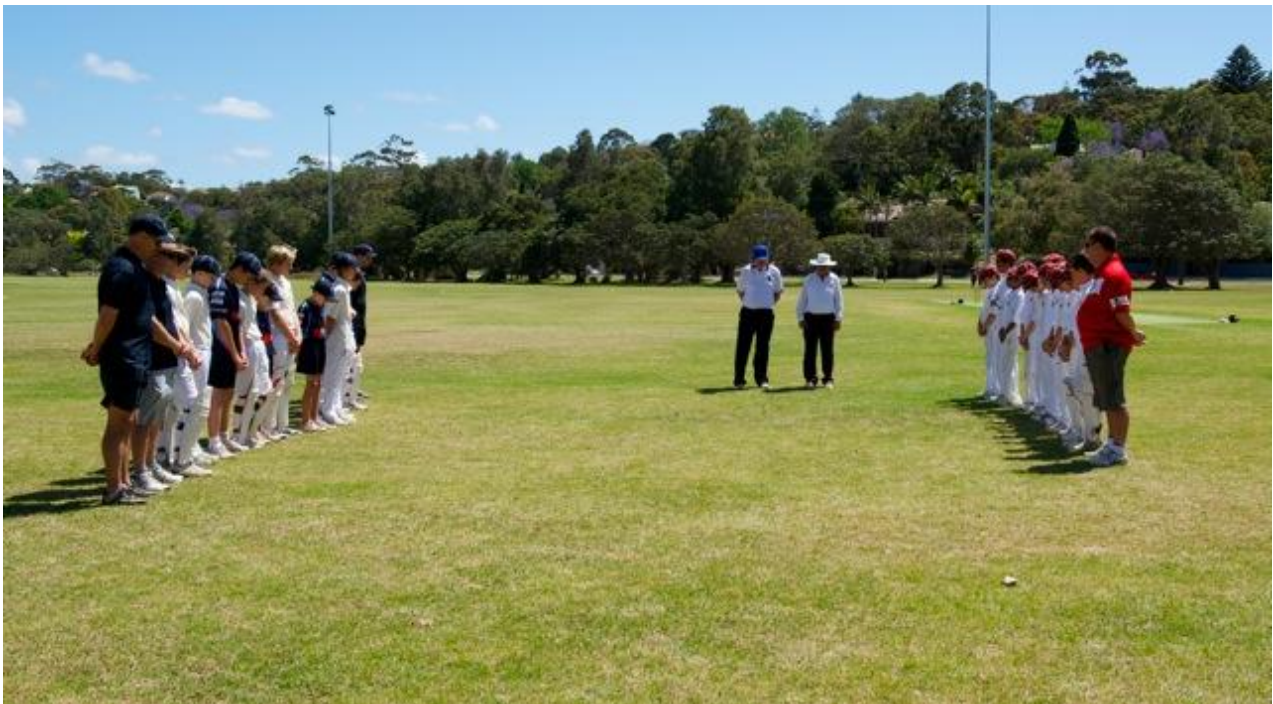
The Gee Shield U13 match took a break at 11am on 11 th November for a minute's silence. It's fantastic to see the importance of this great tradition being passed on to the boys

The standard of catching and fielding was exceptionally high throughout the season; such to the extent in the semi-final win against Sutherland that both umpires commented it was the highest standard of fielding either umpire had seen in over 20 years of umpiring. We also enjoyed the remarkable feat of bowling out every team in every game we played. This was largely due to the ability of our bowlers to work in tandem, place enormous pressure on the batters and executes bowling plans accurately, combined with high quality fielding, catching and wicket keeping.