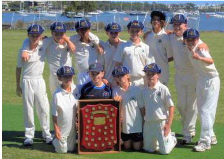
Under 11 DCA J.H. Creak Shield Premiership team