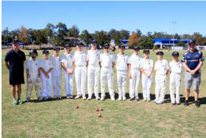
Under 12 DCA Arch Cawsey Shield team